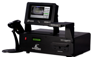
IRONCLAD Erasure Verification System