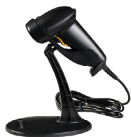
SCAN-1X Media destruction software and scanner