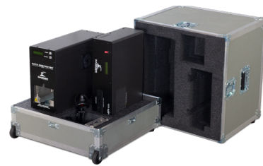
Degauss, Destroy Mobility Package (DDM-25SSD)