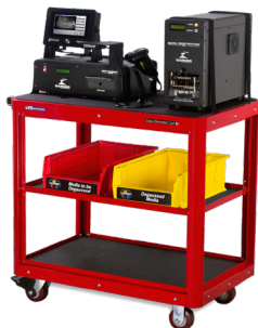
Data Eliminator Cart Package (RCC-25SSD IRONCLAD with optional bins)

Our cases and carts are designed to give you field mobility in every type of situation from the office to the battlefield. Our workstation table is lightweight and features a locking cabinet for storing media.