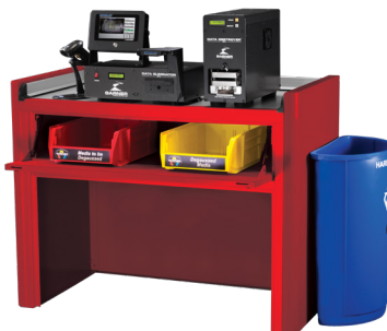
Degauss, Destroy, Recycle Workstation package (DDR-25SSD IRONCLAD)