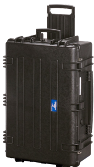
CASE-HD2XIC MIL SPEC Shipping Case